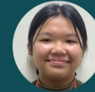
Rio T. Subsidiarity