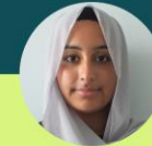
Rihanna A. Dignity of the Person