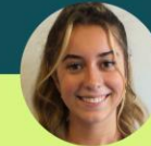
Ruby B. Option for the Poor